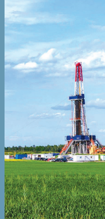
Real Estate, Land Use & Zoning