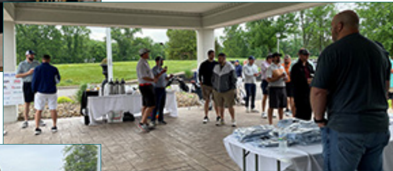
At right, Spring Swing participants take time to visit before hitting the links.