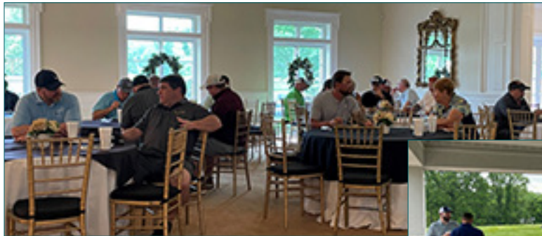
At left, Spring Swing participants enjoy lunch at Berry Hills Country Club in Charleston during the 2024 GO-WV Spring Swing.

Thanks to all of our sponsors and you can see them on pages 14 and 15.