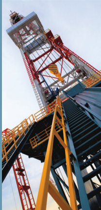
Energy & Natural Resources