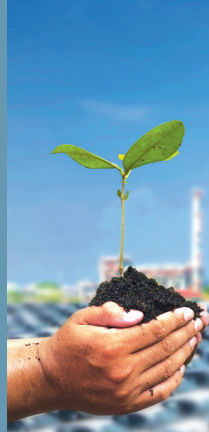
Environmental & Regulatory