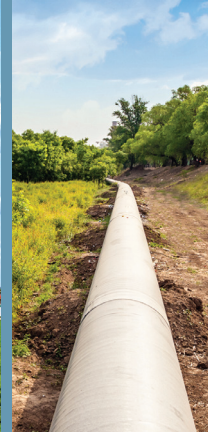
Pipeline & HazMat Safety